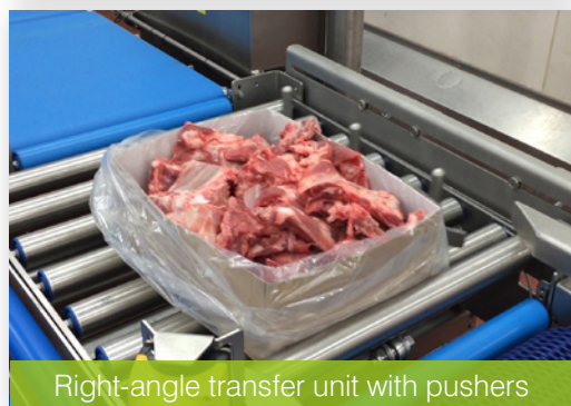
Right-angle transfer unit with pushers